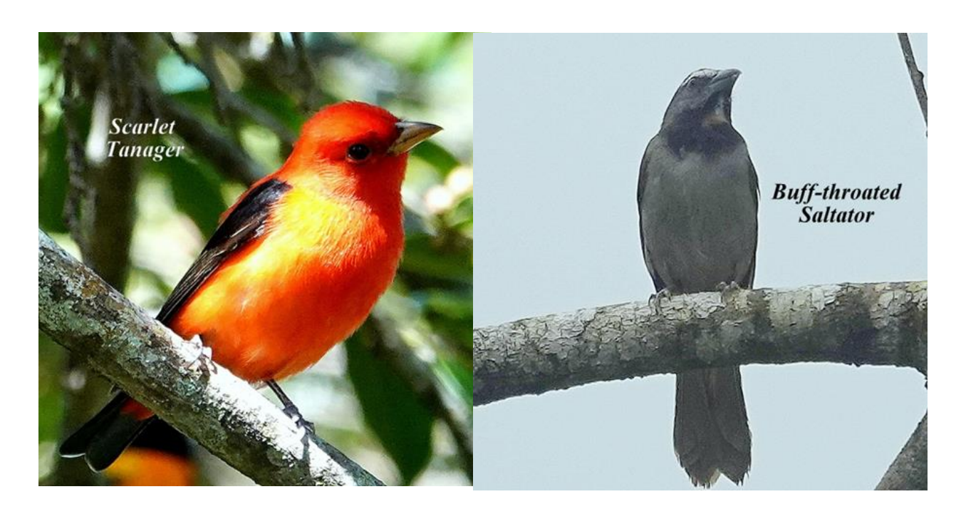
Finches and Sparrows